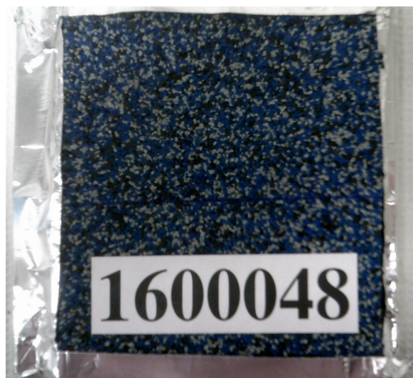
Sofsurfaces Recycled Rubber Playground Flooring as received (left) and tested (right)