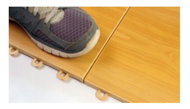
Step 4 Gently step on each tile. You will hear and feel it snap into place. Repeat these steps until your Tap Dance Board Kit is 3 tiles wide and 3 tiles long.

All tiles on any given installation should ALWAYS HAVE THE FEMALE LOOPS GOING IN THE SAME DIRECTION.