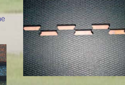
AISLE WAYS: Use 1/2" Diamond interlock mats to cover your Aisle Ways. *Our 1/2" interlock mats come in 5 colors; Emerald, Coral, Midnight, Glacier and Black!!!!!

WASHBAYS: Our 1/2" Button mats provide superb traction for the horse, and person working with the horse in wash stall areas. We recommend using our patented interlocking Wash Stall Mat System, which will prevent your mats from slipping or moving about. Custom sizing available. Antibacterial and anti-fungal.