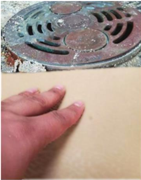
Fixture too high; ramping required