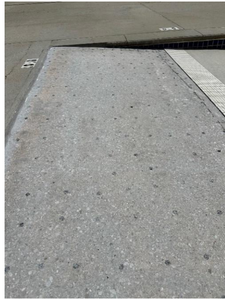
Properly ground "salt & pepper"